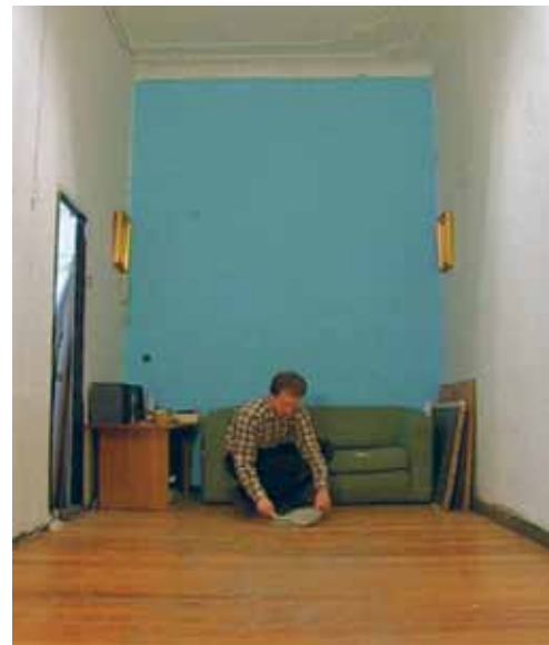
Honza Zamojski, Third time lucky , 2009, DV-PAL, 26'38" (loop).