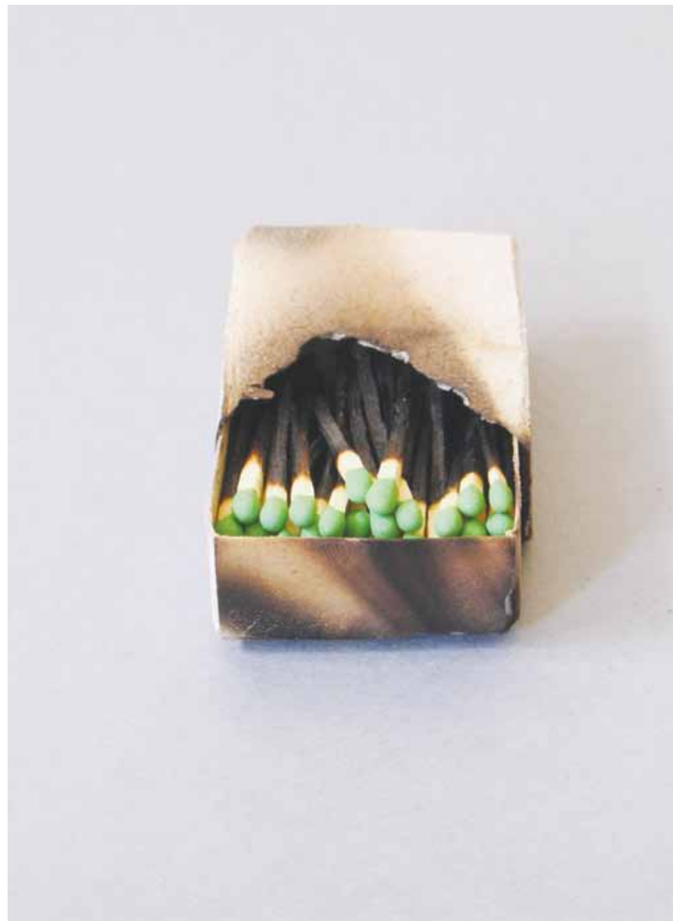
Form left, Honza Zamojski, I didn't do it , fire on matches, 2009 and Negative fire on matches , 2009.